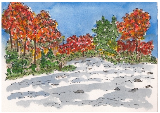
What's opening up for you?